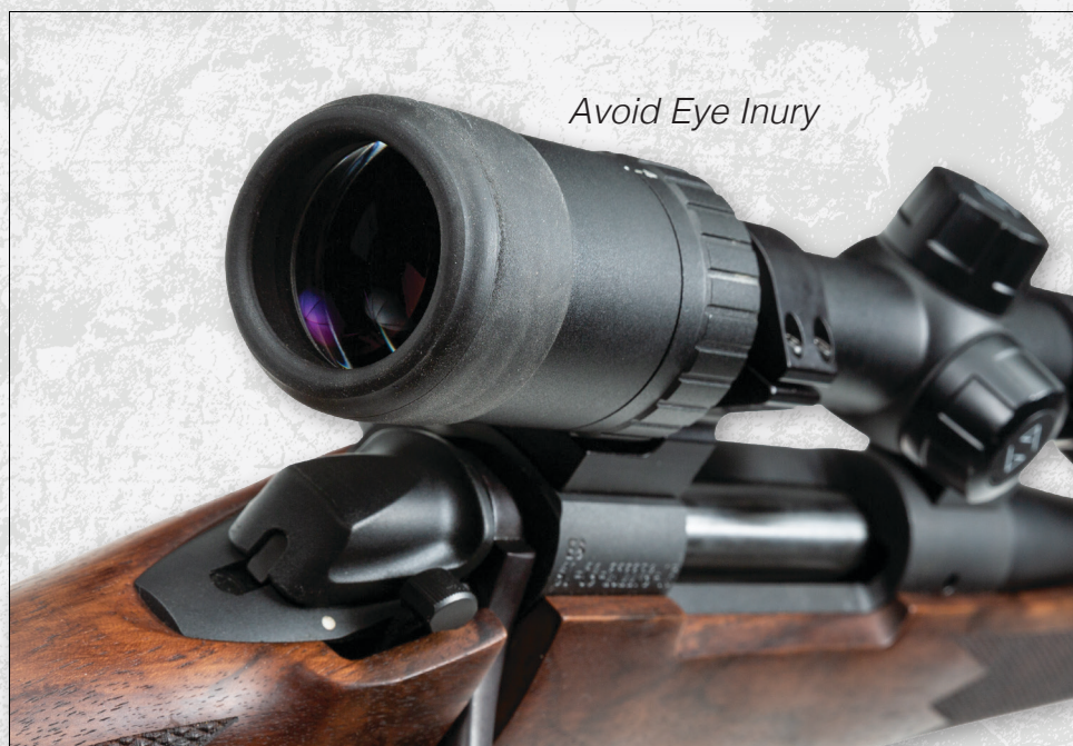
Avoid Eye Injury