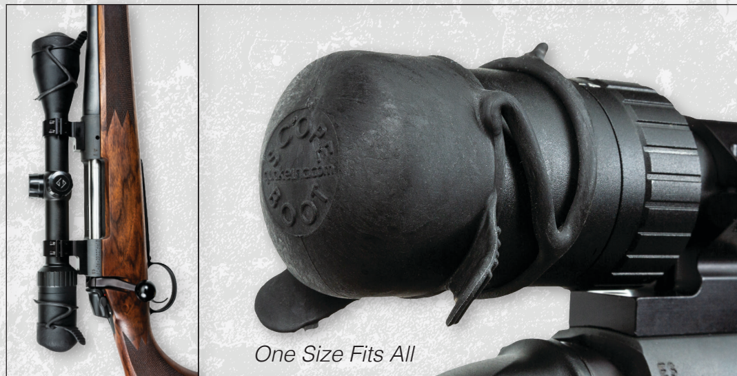
One Size Fits All

The SCOPE BOOT™ can be used with other optics such as compact or regular sized binoculars, scopes, flashlights and commercial optics, which fall within the diameter stretch range.