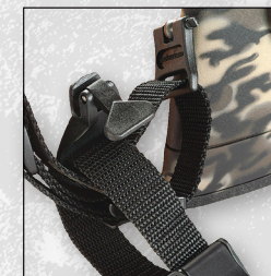
Quick Disconnect Clip

The CLAW® Crossbow Sling is setting the standard for crossbow users. Designed for rugged, demanding conditions, the CLAW® Crossbow Sling uses a quick-disconnect clip to hold the top-heavy crossbow firmly against the user's body for hands-free, struggle-free walking and stalking. With a simple flick of the thumb, the clip releases so the crossbow can be easily pulled into shooting position.