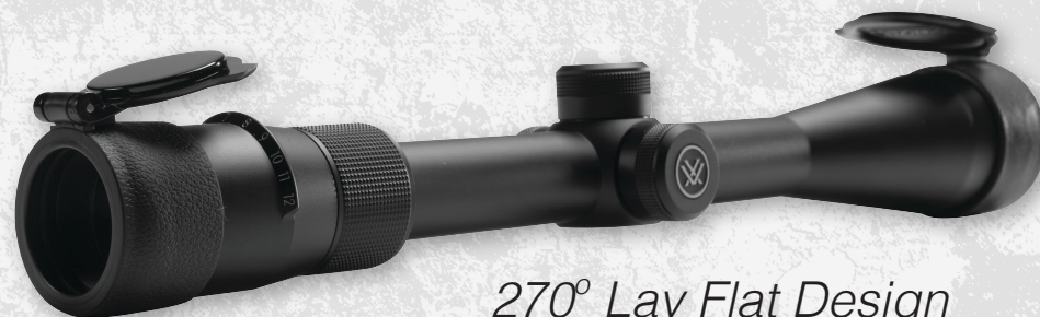
270° Lay Flat Design

Please refer to the measuring guide on this page for accurate sizing. BUSHWACKER™ 270° Optic Covers also fit Redfield® Low Profile® and Widefield® scopes. As with all transparent covers on the market, the See-Thru model will cause a point-of-impact change at longer ranges. Although this is insignificant at close range targets, it is recommended that the See-Thru be flipped open for critical, longer range shots.